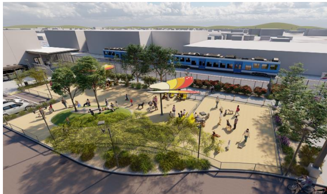
Future Dog Park at Covina Recreation Village

Covina Recreation Village is Under Construction! The groundbreaking ceremony for this "once-in-a-lifetime project" was held in September. The project has three construction phases, with the first phase estimated to be completed in late 2025. Covina Recreation Village will create new amenities for the community such as Covina's first-ever indoor gymnasium building which will feature a rock-climbing wall, basketball, and volleyball courts. The park will also have a dog park, a children's play area, a new library, retail kiosks, shade trees, and paths with drought-tolerant plantings. The park will be located immediately east of the Covina Metrolink Station, at 640-680 N Citrus Avenue, and will provide additional recreational space and amenities for Covina residents and visitors. It will surely be a great place to enjoy a local deli sandwich!