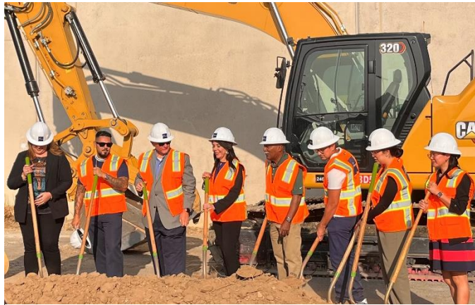
Groundbreaking Ceremony at Covina Recreation Village